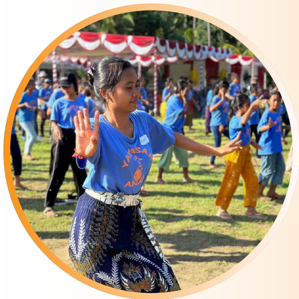
Jerusalema dance at the ANAK 20th anniversary in Bali