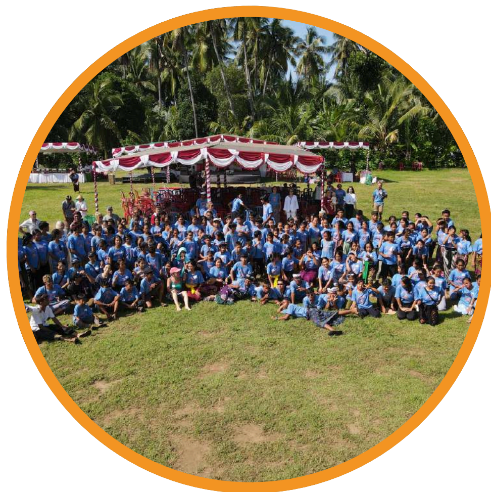
20 years of the association ANAK - Aid to Indonesian Children

BONUS — 3 VIDEOS RECAPPING THE 20TH ANNIVERSARY DAY